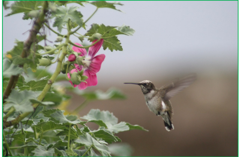
Photo contest 1st Place: Tommy Wasden “Island Bush Mallow and Hummingbird”

The photo contest was a great success and we can’t wait to do it again next year. So keep a camera handy on all your natural adventures...you never know when that “Kodak moment” could turn into a prize-winning photo!