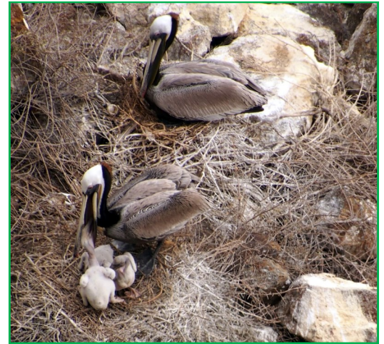
California brown pelicans nesting on Anacapa Island

The project is led and managed by our partner, South Coast Habitat Restoration, a local non-profit organization. CIR is providing assistance with the removal of non-native plants, and is arranging for the bulk of the volunteer help. California State Parks is another partner, and funding from the project has come from the Southern California Wetlands Recovery Project, California Department of Fish and Wildlife, Earth Island Institute, the Wildlife Conservation Board and Southern California Edison. The last scheduled planting day is March 8, but volunteers may also be needed to help water the plants until they become established.