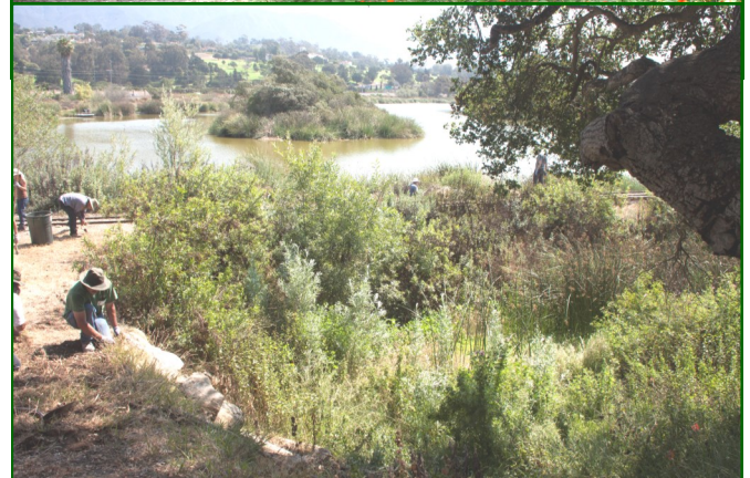
Above: a section of the Zoo project before restoration. Note invasive Myoporum trees and cape ivy. Below: the same view after restoration.