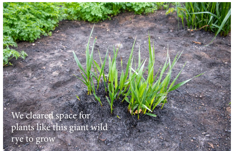
We cleared space for plants like this giant wild rye to grow

Taking this step allowed the volunteer crews to proceed rapidly and with a more heavy-handed approach to eliminating the invasive plants. With hoes and hands, we created buffer halos around the identified native plants. Soon everyone was adept at identifying even