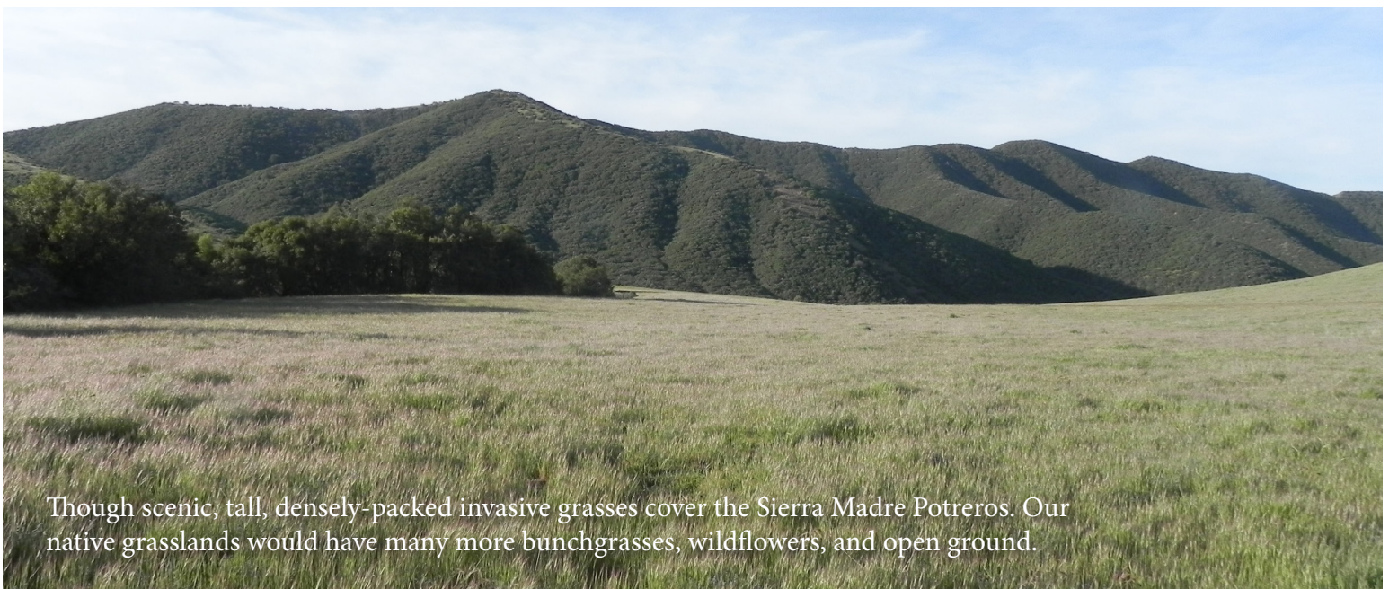
Though scenic, tall, densely-packed invasive grasses cover the Sierra Madre Potrerillos. Our native grasslands would have many more bunchgrasses, wildflowers, and open ground.

Here on the Central Coast, we’re working hard to ensure that birds can always call this home. Our work at the San Marcos Foothills Preserve is specifically designed to improve bird habitat. The Preserve contains over 50 acres of open grassland habitat, and such an expanse is found almost nowhere else in the Santa Barbara - Goleta area. While the Preserve is home to one of the best and most extensive native grasslands in the region, much of the grassland habitat on the Preserve is covered by invasive annuals like ripgut brome,