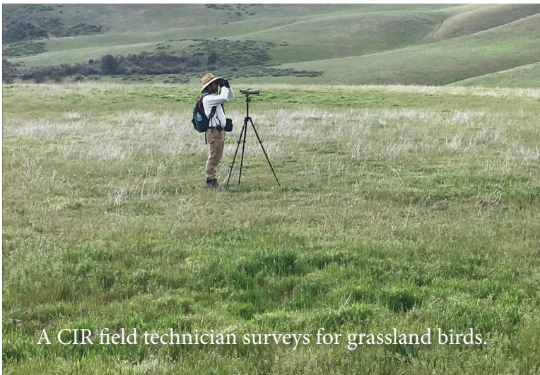
A CIR field technician surveys for grassland birds.

black mustard, and other species from Europe and the Mediterranean region. These don't provide the habitat structure that many grassland-dependent birds need.