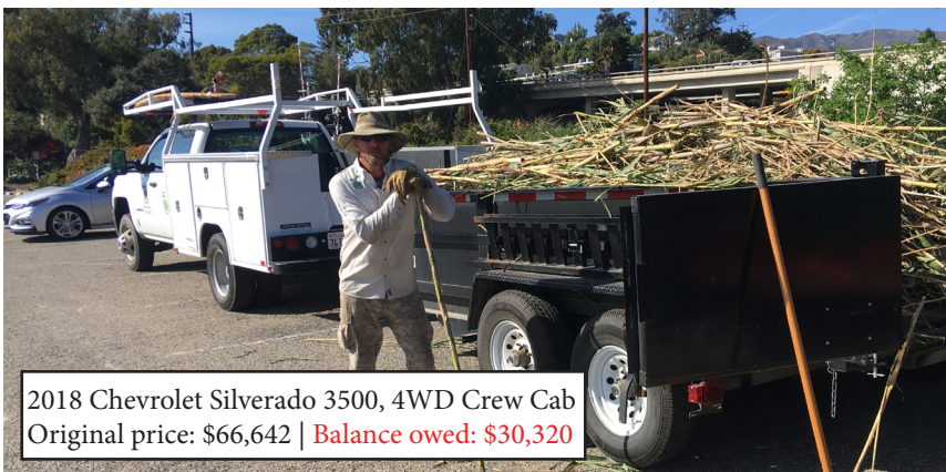
2018 Chevrolet Silverado 3500, 4WD Crew Cab Original price: $66,642 | Balance owed: $30,320

“These new 4-wheel drive work trucks are a game changer for CIR! They allow us to take on restoration projects we have only dreamed of in the past. Gone are the days when we weren't even sure if our work truck will get us to the job site...and many times it didn't. We now have a level of reliability, safety, versatility, and confidence in our equipment that we never had before. The storage boxes in the bed of the truck allow us to keep an amazing amount of equipment, supplies and safety gear available at all times. We have doubled our weight carrying and towing capacity. This allows us to haul nearly 2,000 gallons of irrigation water to our planting sites. The seating for 6 staff and volunteers allows us to bring a large crew to job sites.”