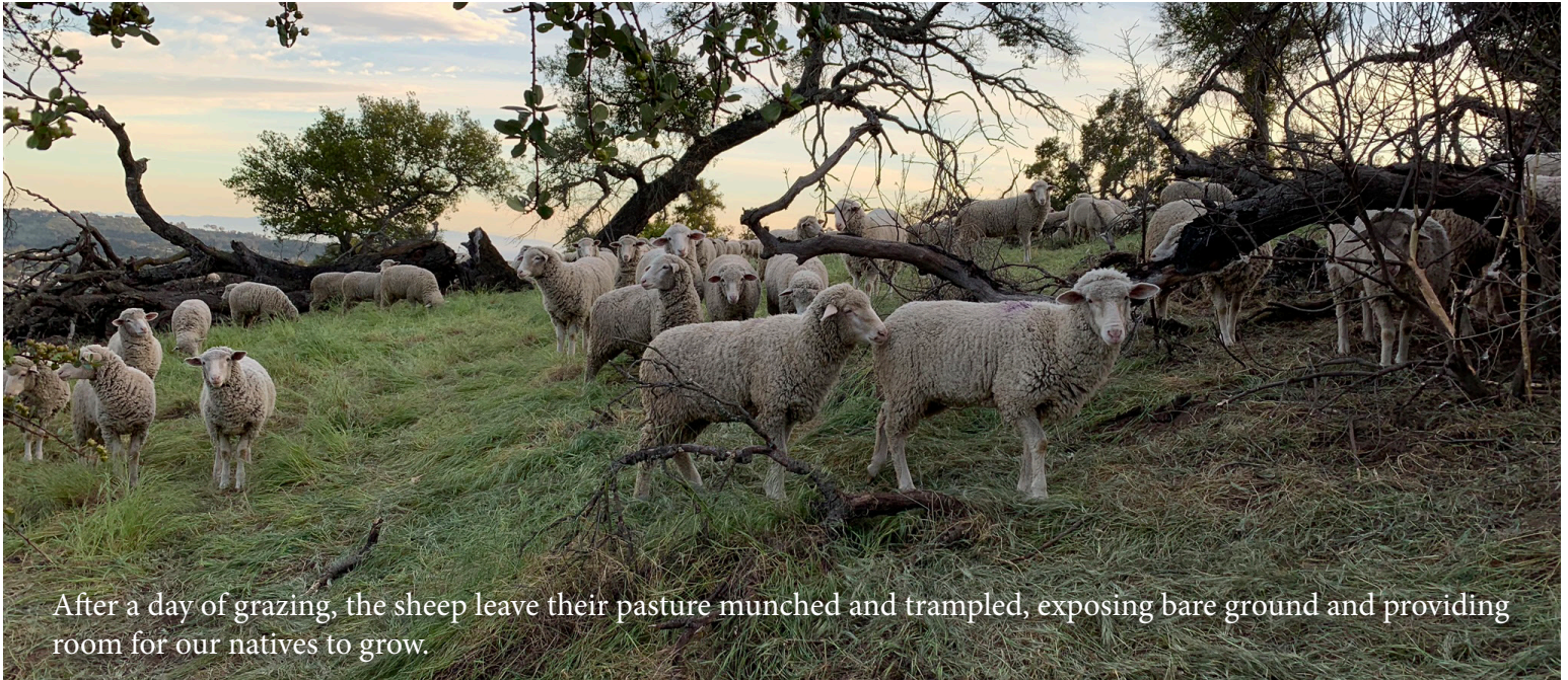
After a day of grazing, the sheep leave their pasture munched and trampled, exposing bare ground and providing room for our natives to grow.