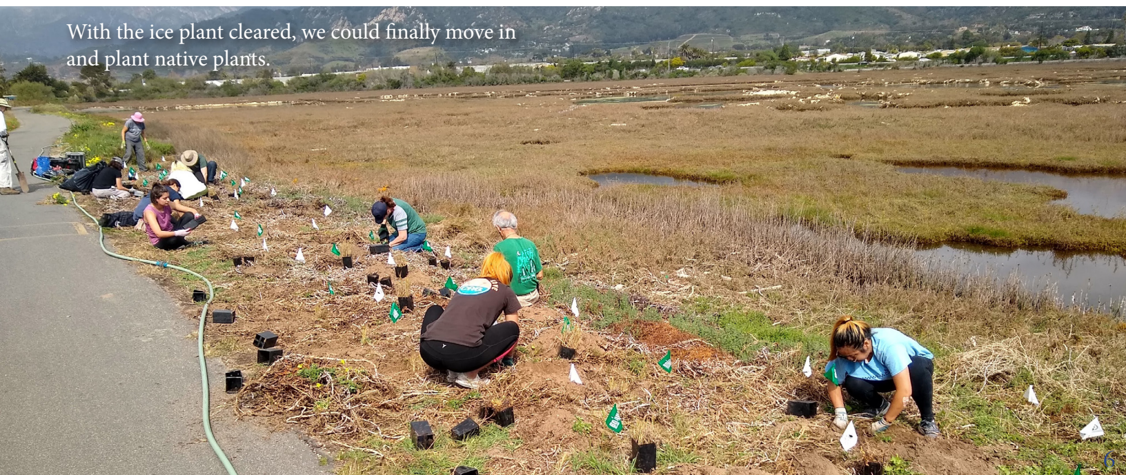
With the ice plant cleared, we could finally move in and plant native plants.

This project is only possible because of the contributions of the neighbors on Sand Point Road and the Gas Company who contributed funding, and volunteers who did the dirty work. The Carpinteria Salt Marsh needs all the help it can get. I no longer have doubts about the success of this project. With community and volunteer support like we have had on this project, I'm confident the salt marsh will outlast me, and with a little assistance, so will salt marsh bird's-beak.