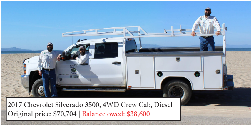
2017 Chevrolet Silverado 3500, 4WD Crew Cab, Diesel Original price: $70,704 | Balance owed: $38,600

Last year, as we were gearing up for several large projects, generous CIR supporters contributed to our down payments for the two utility trucks, but we still owe nearly $69,000 before we are debt-free. These vehicles have revolutionized the way we work. Please help us retire the debt on these two trucks.