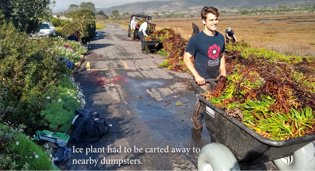
Ice plant had to be carted away to nearby dumpsters.