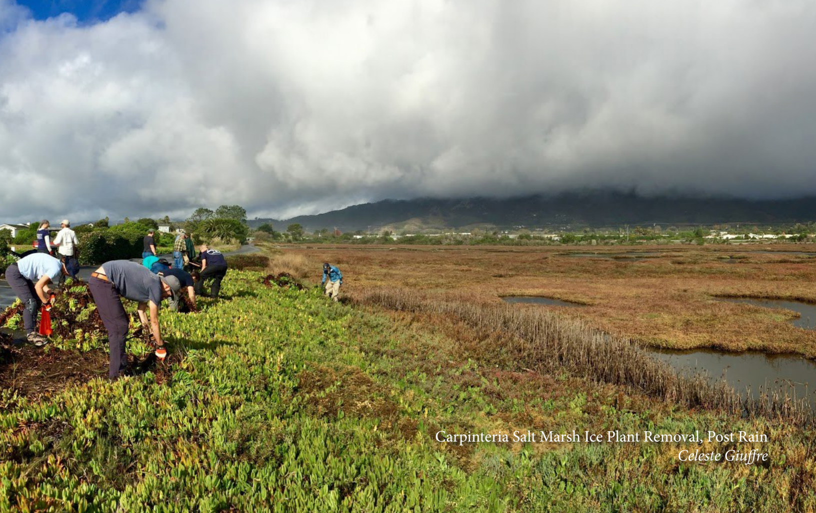
Carpinteria Salt Marsh Ice Plant Removal, Post Rain Celeste Giuffre

cirweb.org | contact@cirweb.org | (805) 448-5726